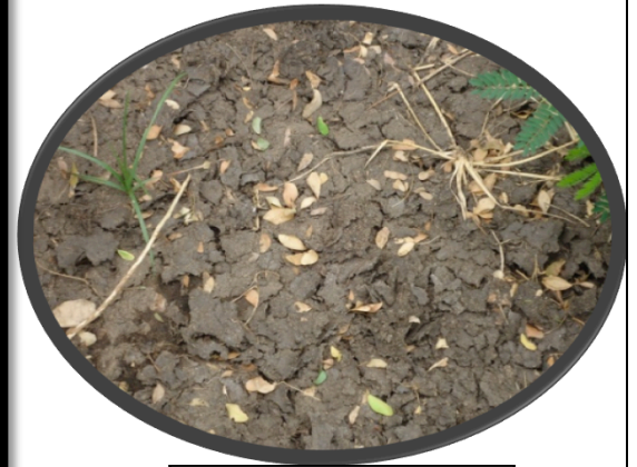
SLURRY IN THE FIELD