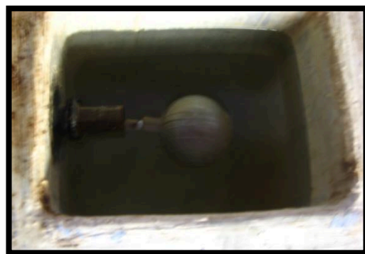
BALL FLOAT MECHANISM

The farmer rears 50 cows, 20 goats & sheep under preparation to rear country hens. He maintains good sanitation in the rearing shed by recycling the cattle wastes. Head to head system of rearing is followed. Automated water bowl for feeding water to the cattle which works on the Ball Float mechanism are placed. The cattle are periodically groomed and deworming is done once in 3 months using Ivermectin.