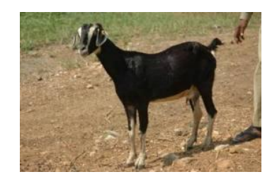
Ethno veterinary practices for goat