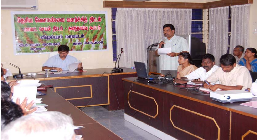
Presentation by the Line Department officials