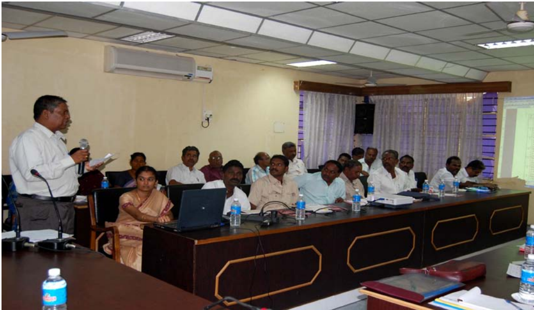
Presentation by the Line Department officials