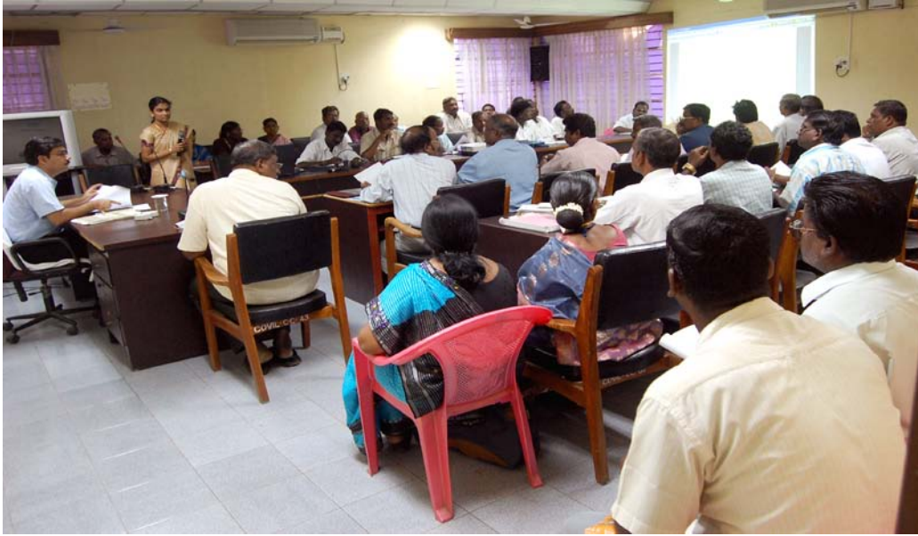
View of the participants