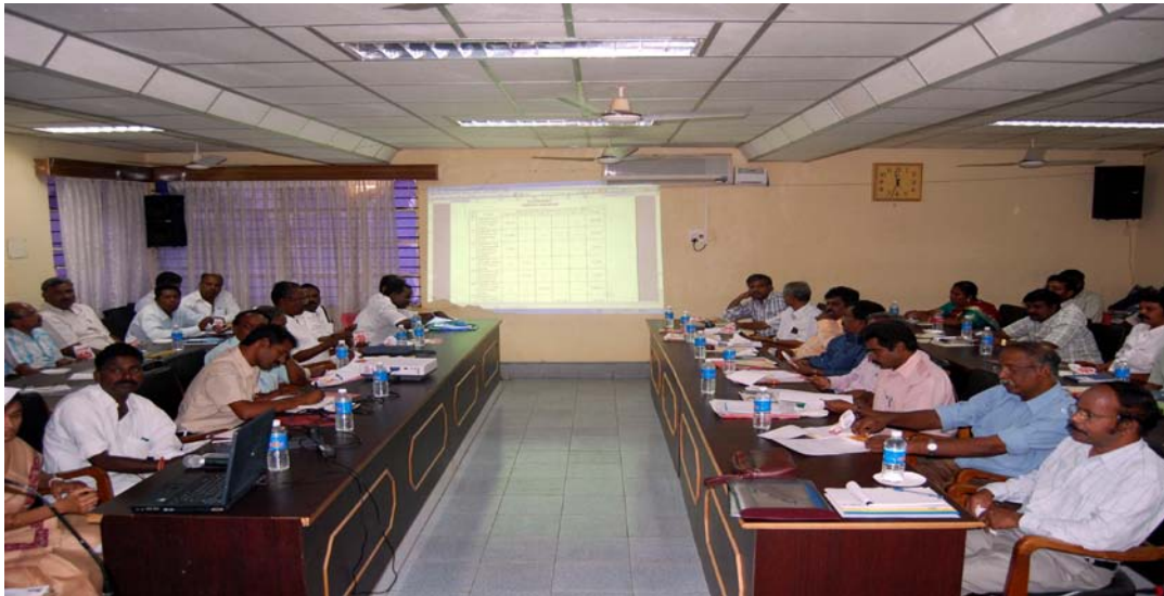
View of the participants