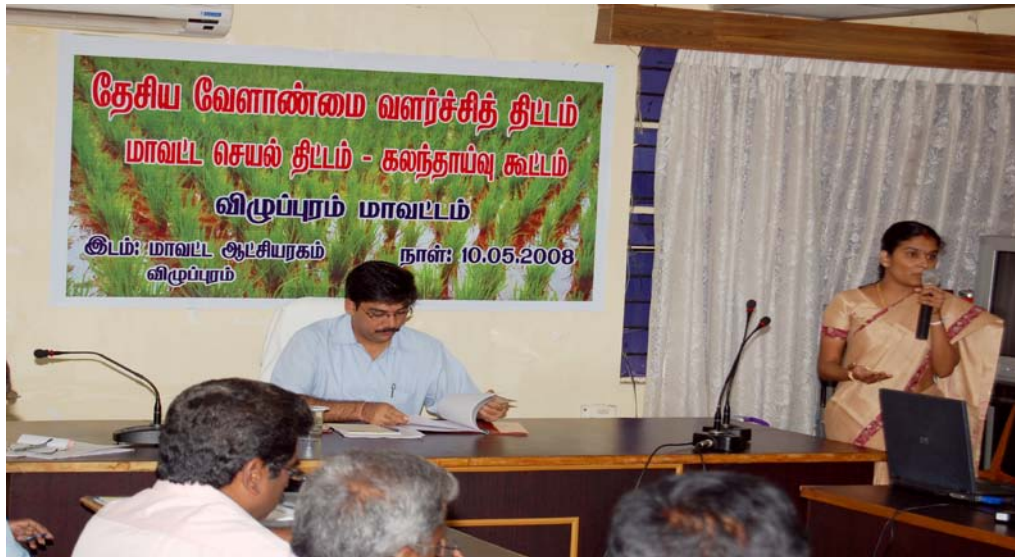
Presentation by the Coordinating Scientist from TNAU