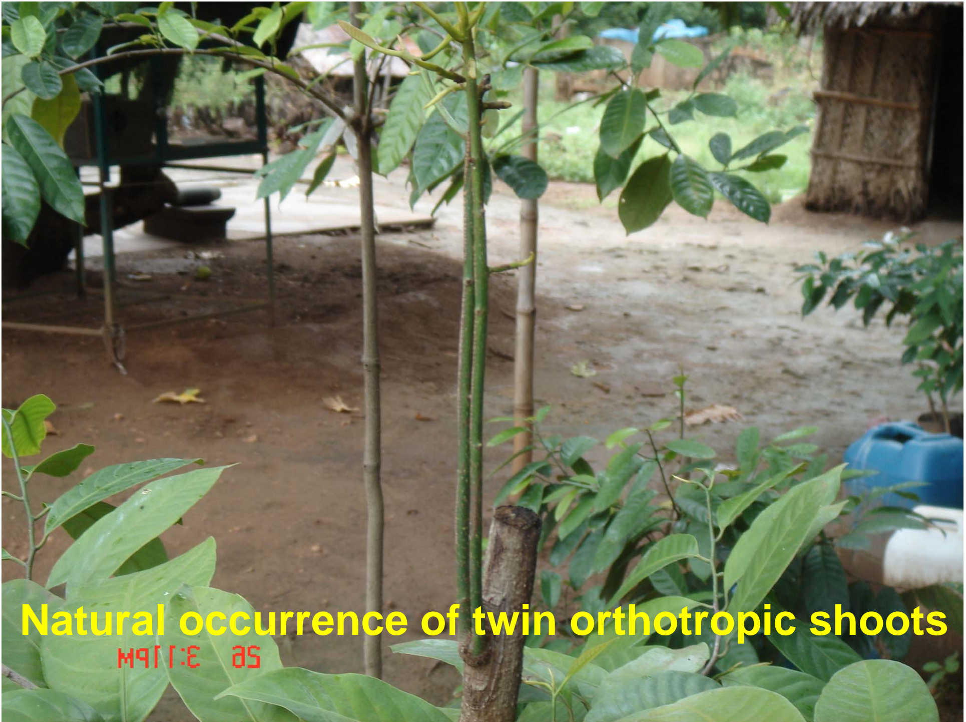
Natural occurrence of twin orthotropic shoots