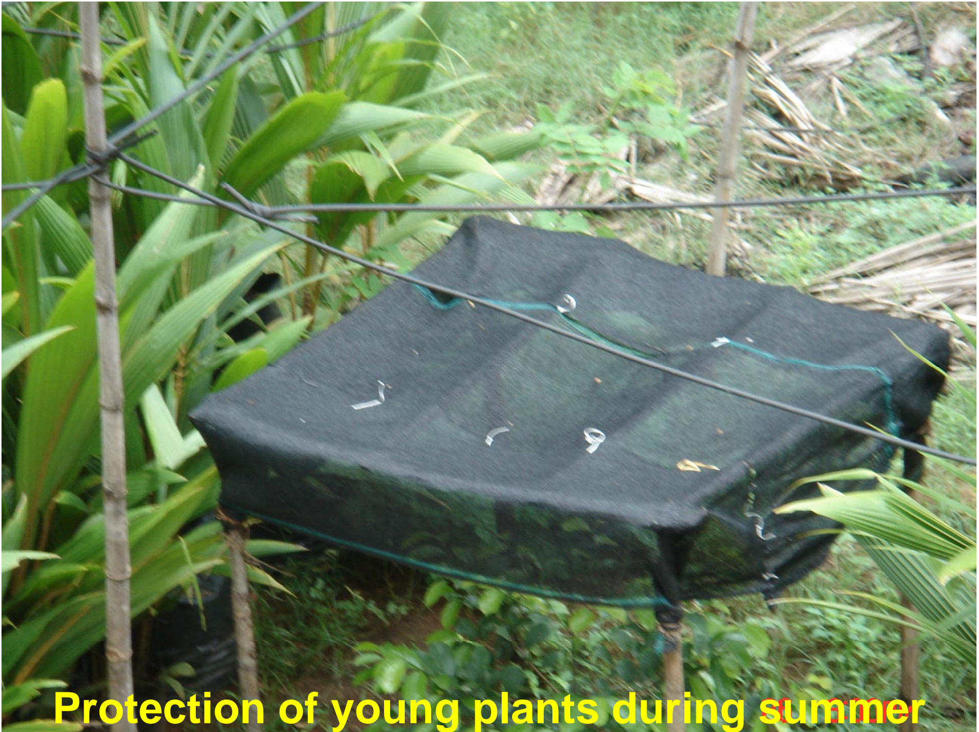
Protection of young plants during summer