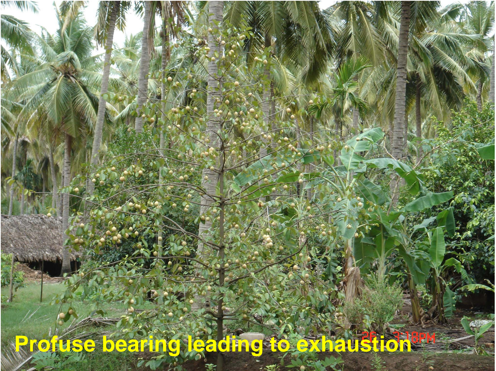
Profuse bearing leading to exhaustion