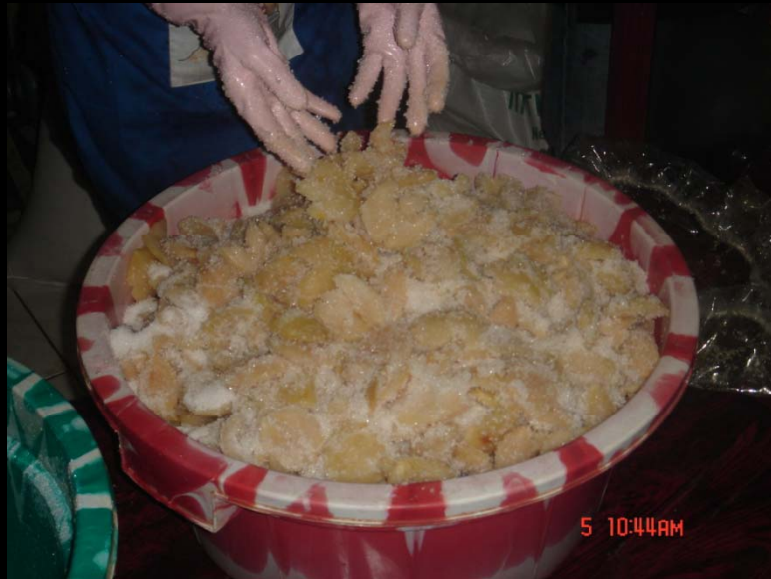
Nutmeg leather fruit – Manado Island - Indonesia