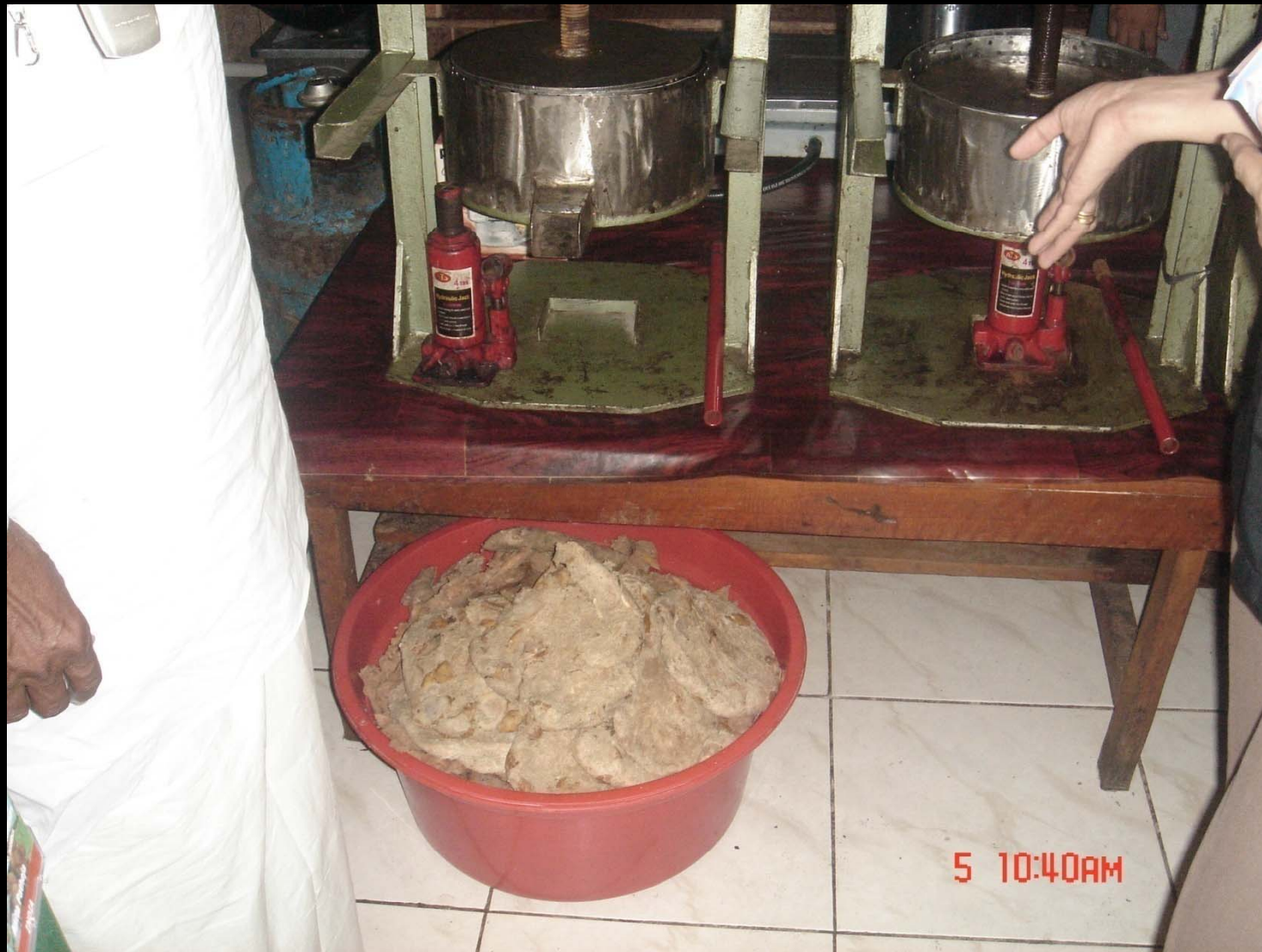
Juice extraction from nutmeg pericarp for syrup making