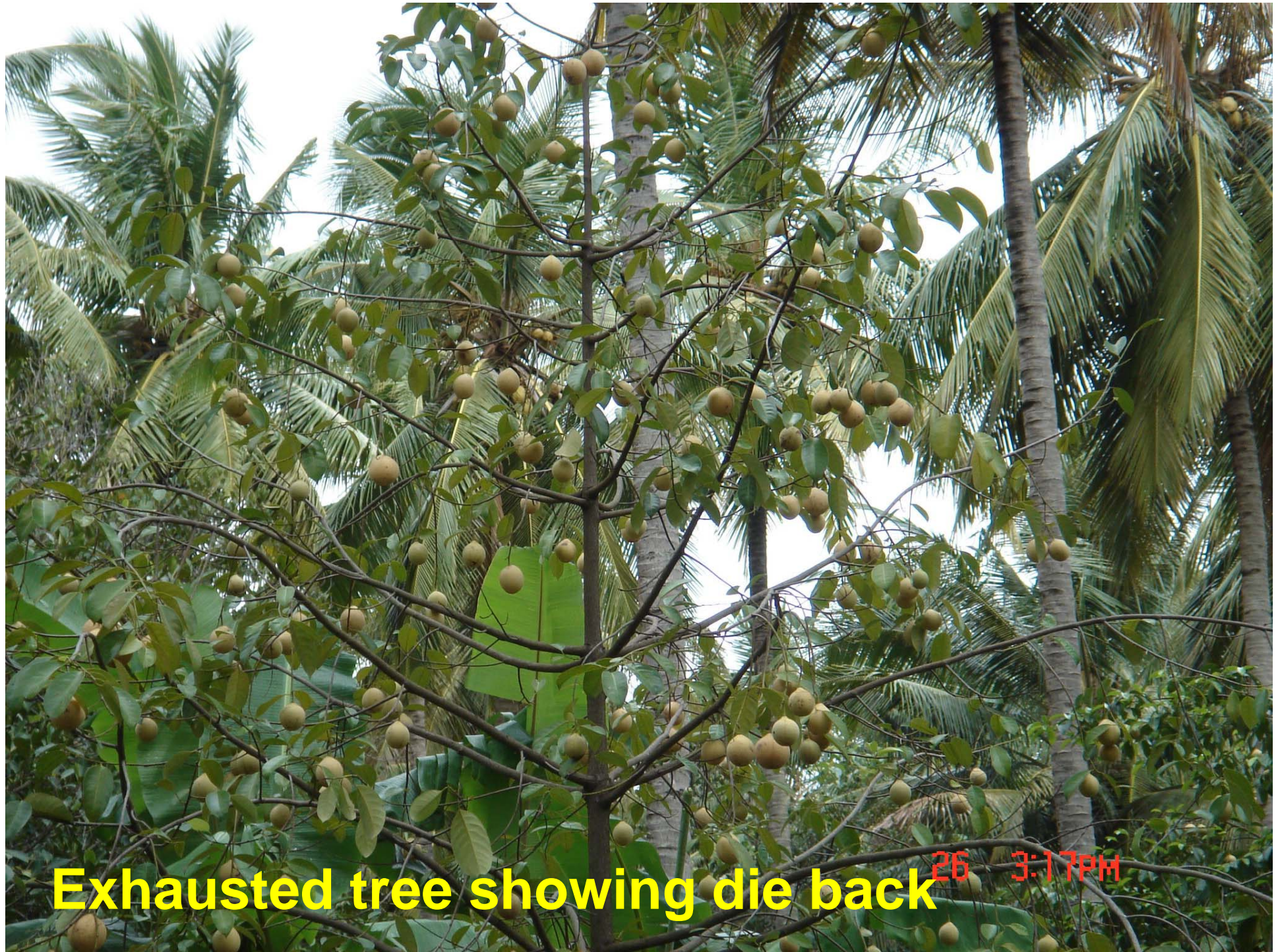
Exhausted tree showing die back 26 3:17PM