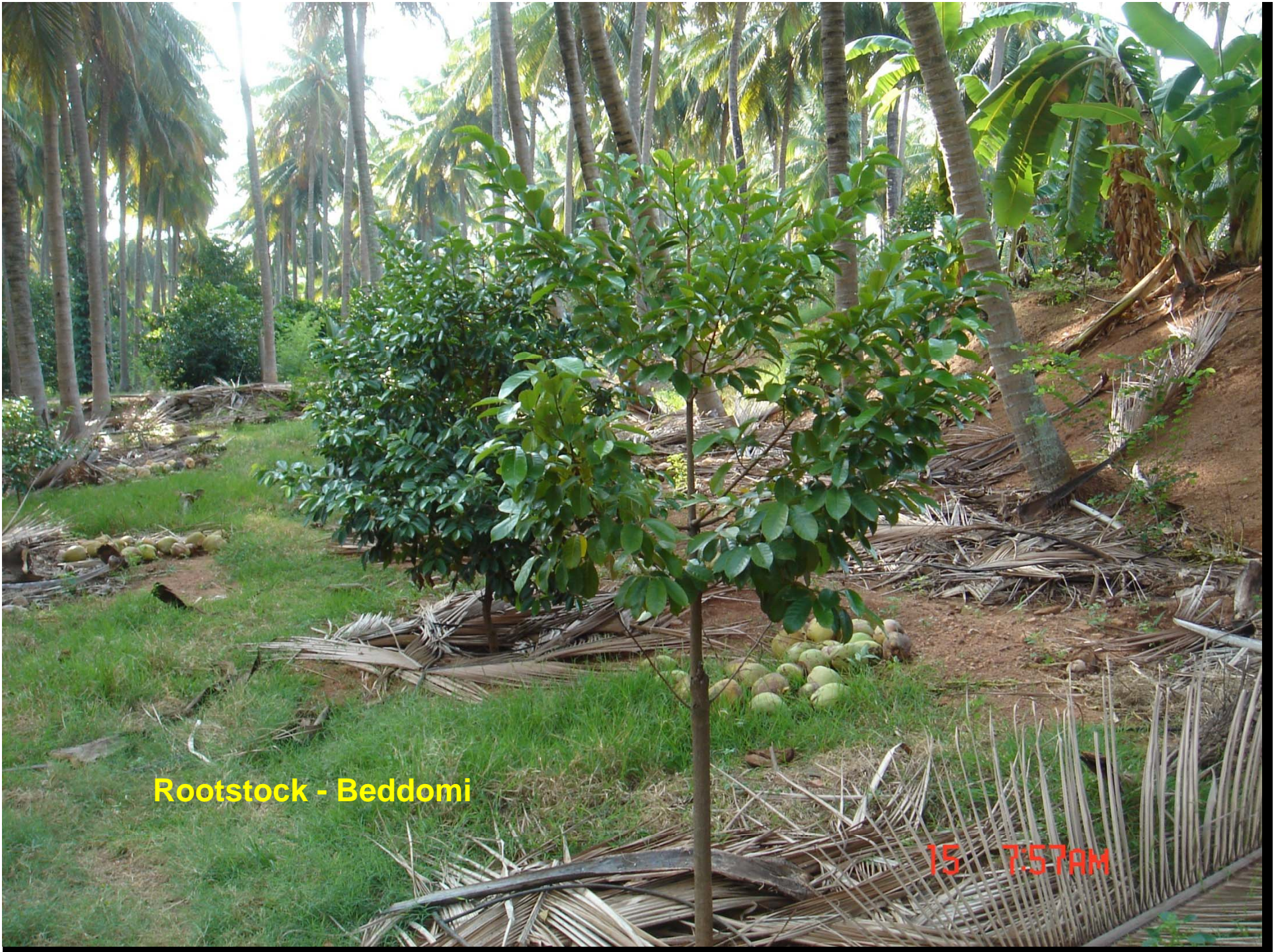
Rootstock - Beddomi