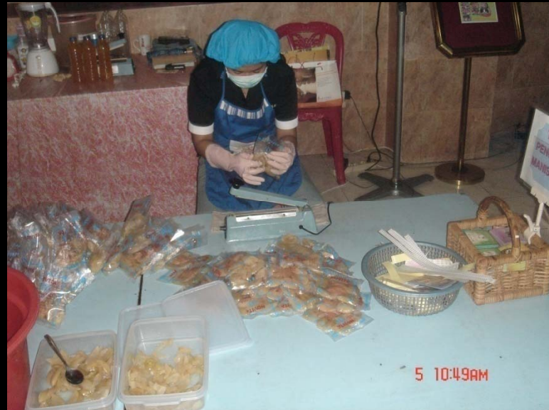
Packed leather fruits