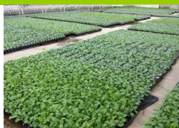
Cole Crops (Nursery)