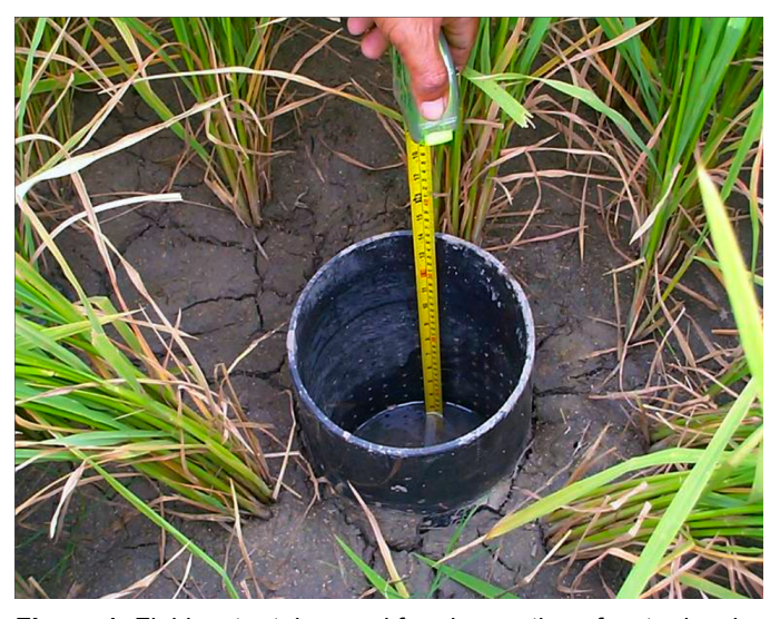
Figure 1. Field water tube used for observation of water levels by farmers. The ability to observe the level of the water table below the soil helps build confidence in AWD.

Reduced water use. By reducing the number of irrigation events required, AWD can reduce water use by up to 30%. It can help farmers cope with water scarcity and increase reliability of downstream irrigation water supply.