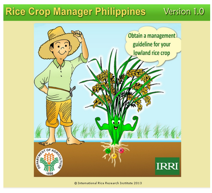
Figure 4. Rice Crop Manager is an open-access web application that allows extension agents to enter basic location and management information in the field and give farmers immediate fertilizer recommendations.

A decade of research at IRRI has developed the approach of site-specific nutrient management. This approach allows farmers to tailor nutrient management to the specific conditions of their field. IRRI has developed a computerand mobile phone-based application called Rice Crop Manager that provides farmers with site- and season-specific recommendations for fertilization. The tool allows farmers to adjust nutrient application to crop needs in a given location and season.