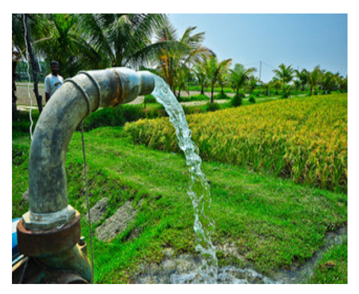
Figure 3. Pump irrigation in the Philippines.

Proper design of irrigation schemes and coordination among farmers, irrigation authorities, and local governments can enable large-scale benefits from AWD. In the Philippines, water for irrigation is a limited and dwindling resource due to competition with residential and industrial uses, increasing frequency of drought, and pollution of surface waters. Since the early 2000s, the International Rice Research Institute (IRRI) has collaborated with the Philippine Rice Research Institute (PhilRice) and the National Irrigation Administration (NIA) of the Philippines to disseminate AWD as a water-saving technology. These efforts became more urgent in 2009, when decreasing irrigation water supply during the dry season led the Department of Agriculture to issue an administrative order for the adoption of water-saving technologies in irrigated rice production. This created an opportunity for large-scale implementation of AWD, with benefits not only for water savings but for coping with climate change as well.